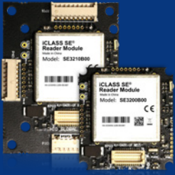
iCLASS SE Reader Modules