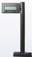
Multiple options available in English or Metric units